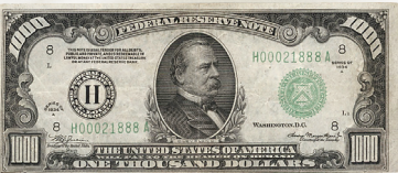
31% 1934 A federal reserve $1000 note VF $1977.