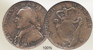
100% (1795) copper North Wales halfpenny, plain edge Obv: bust of George Washington Rev: Celtic harp NGC XF45 BN $775.