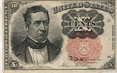
58% 1874-1876 Reconstruction fractional USA ten cent notes Obv: Wm Meredith, Sec Treasury in 1850 EF $47 VG-F $27