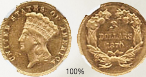
1870-P gold $3 USA NGC AU 53 $2775.