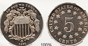
1871 shield nickel NGC Proof 64 PQ (bright with no spots or streaks) $697.