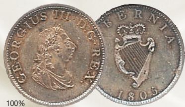
100% 1805 Ireland copper halfpenny NGC Proof 63 BN $297.