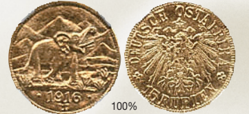
100% 1916-T gold 15 rupien of German East Africa Obv: elephant on plains before Kilimanjaro? Rev: Reich eagle NGC AU 58 $5700.