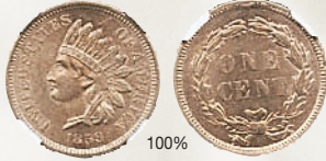
1859 First year Indian Head NGC MS 63 $677.