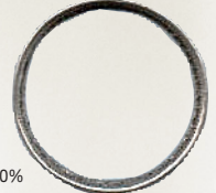
100% C1944 Pacific theater WWII, silver trench art ring made from Australia silver florin. Size 10 1/2 ready to wear, bit unfinished on inside, showing coin lettering $127.