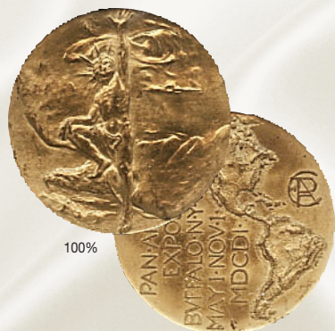
100% 1901 Pan American Expo medal, brass, one of the most artistic expo medals Obv: Phoebus or Helios, or Phaeton riding eagle Rev: map of Americas NGC MS 64 $297.