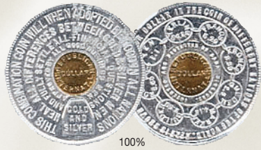
(1897) Bickford proposed dollar, brass insert in aluminum circle, This token advertised his idea of reconciling the coinages of many countries in Europe with the dollar. NGC MS 63 $347.