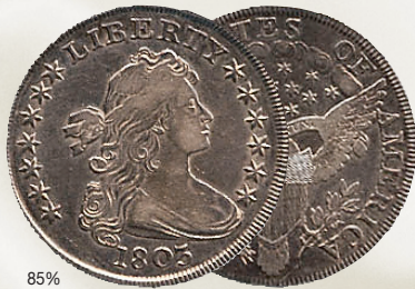
85% 1803 large 3 silver dollar B-6 NGC XF 40 pq lustrous $4977.