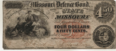
27% 1861 Missouri defense Bond $4.50 note VF or so, wonderful denomination $277.