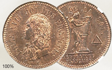
100% (1794) bronze 10 centimes Mazard 394 pattern struck for Louis 17th, who never ascended to the throne of France. Obv: his youthful bust Rev: Angel inscribing constitution NGC MS 65 RB $1277.