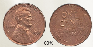
100% 1955-P double die Key variety ANACS MS 61 BN $2177.